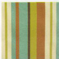
The unbalanced stripes of this outdoor fabric woven in Outdura®, a solution-dyed all-weather acrylic, make for a bold accent in any space. 1708 Sonita—Beachfront, price available upon request; pindler.com