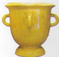
This authentic French planter is made from terra cotta and features a juane emaille finish. Anses 4, price available upon request; authenticprovence.com