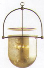
The bronze lantern used on Aumont's veranda features a glass covering coated in an antique mirror finish to diffuse its glow. Urban Smokebell Lantern, $1,754; kohlerinteriors.com

“One of the first things we did after purchasing the home was to add a deck and veranda to make way for indoor-outdoor living space. I wanted to create as many places to lounge and daydream as possible.”