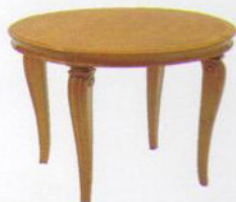
Crafted from sycamore, this traditional round table from France, circa 1940, stands on four sophisticated scrolled legs. Art Moderne Table, price available upon request; bgoecklerantiques.com