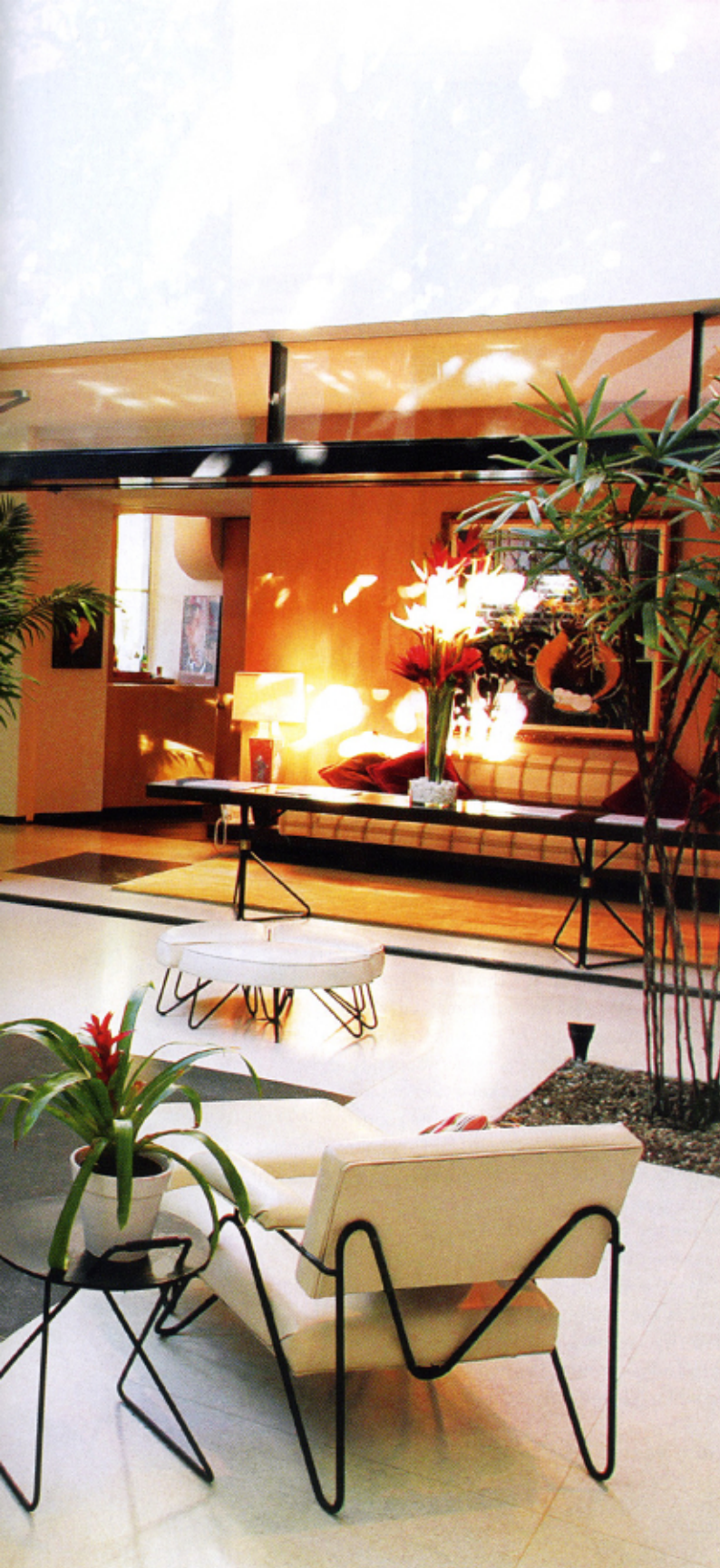
LEFT: KIRK MCKOY © 2010 LOS ANGELES TIMES. REPRINTED WITH PERMISSION