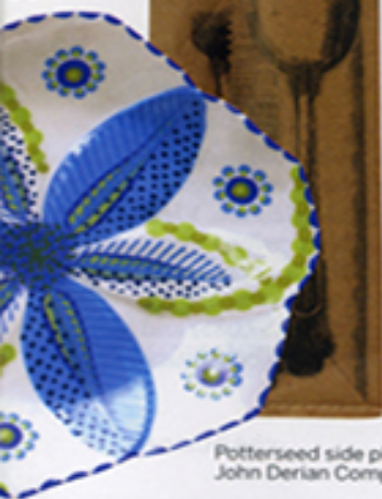
Potterseed side plate, $45; John Derian Company, NYC.