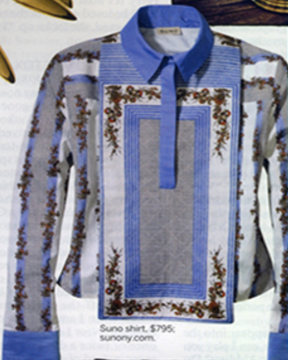
Suno shirt, $795; sunony.com.