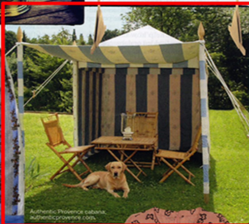
Authentic Provence cabana; authenticprovence.com.