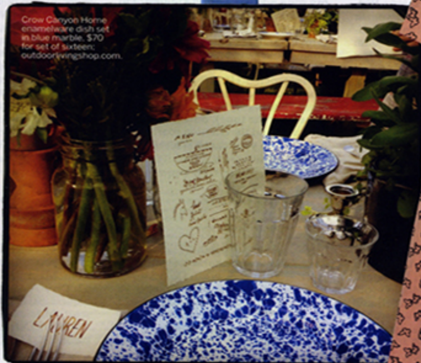
Crow Canyon Home enamelware dish set in blue marble, $70 for set of sixteen; outdoorlivingshop.com.