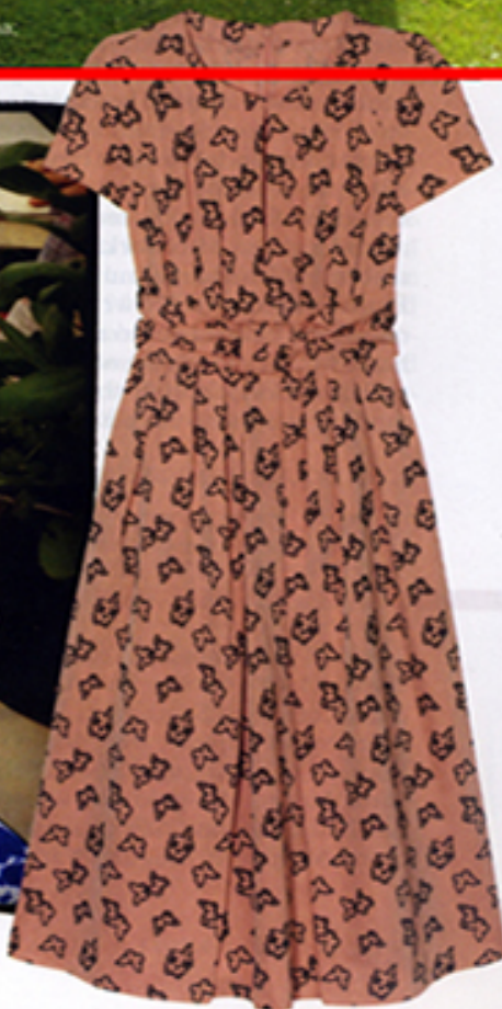
Moschino Cheap and Chic dress, $1,295; Moschino, NYC.