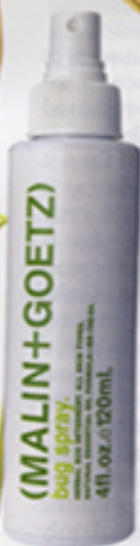
Malin+Goetz bug spray, $20; malinandgoetz.com.