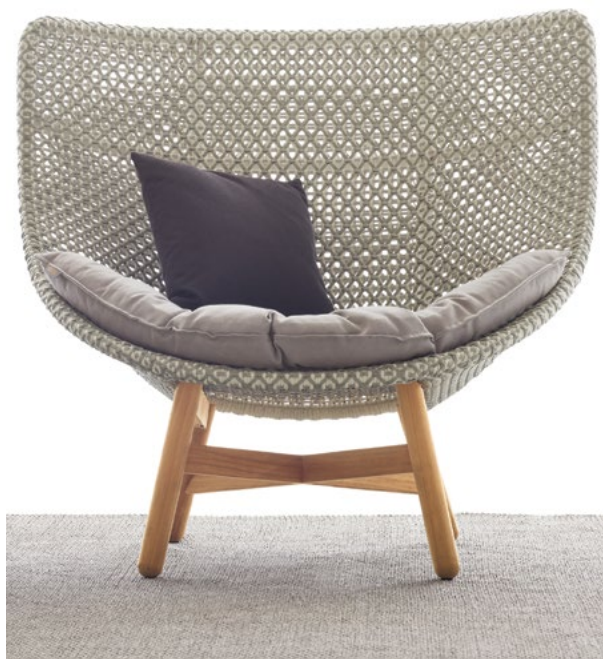
▲ Dedon has debuted two limited-edition color and material combinations for its popular MBrace seating collection, designed by Sebastian Herkner. Carrara and Marrone are woven out of handmade maritime rope from Italy and engineered fiber by Dedon to create a fresh look. dedon.com ■