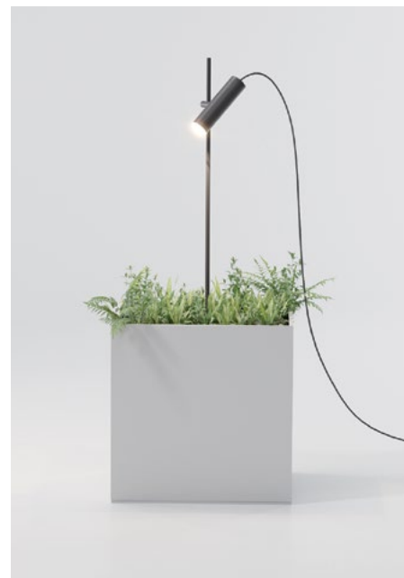
▼ Designed by Kettal Studio, the Dots Collection indoor-outdoor lamp features an adjustable aluminum structure, an LED bulb and a waterproof switch. Available in 30 color options, as a floor lamp with a circular base or a planter lamp (pictured) that can be fastened to the ground. kettal.com