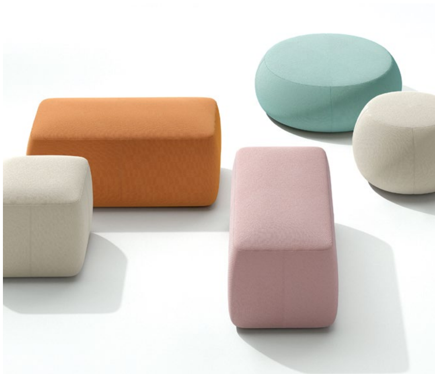
▲ Arper's chic Pix collection of ottomans is now available for outdoor use. A waterproof polyurethane membrane protects the foam interior; choose from a line of durable, fast-drying polyester fabric covers in an array of bold hues. The ottomans come in one-, two- and three-seat sizes; five-seaters can be ordered. arper.com