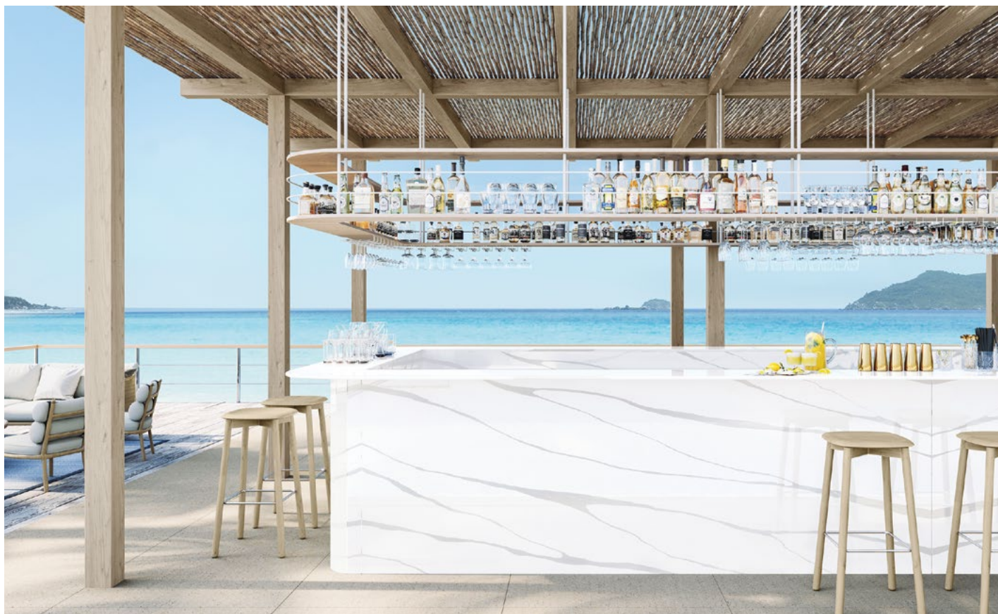
▲ Geoluxe's newly released Calacatta Gluxe is a marble-look engineered surface characterized by vivid gray veining and a pure-white background. Formulated for indoor-outdoor use, the product is scorch-, stain-, heat- and UV-resistant; the veins run throughout each slab, eliminating the need for mitering. geoluxe.com