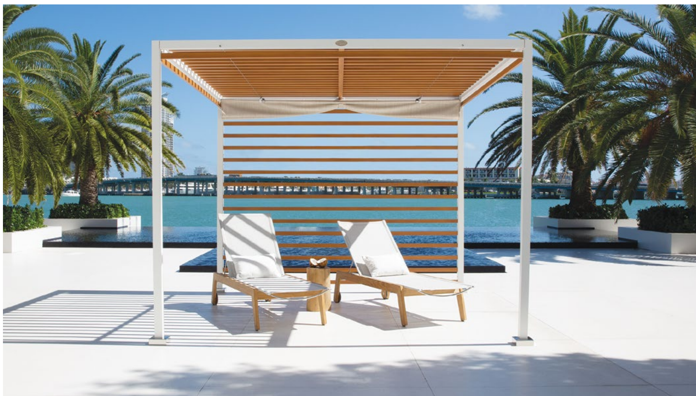
▲ Tuuci's Eclipse Cabana conjures an airy outdoor living room. Its powder-coated aluminum frame supports roof and wall slats that come in a powder-coated or wood-look finish. A retractable Roman shade is made of a durable, UV-resistant mesh fabric and is available in six colors. tuuci.com