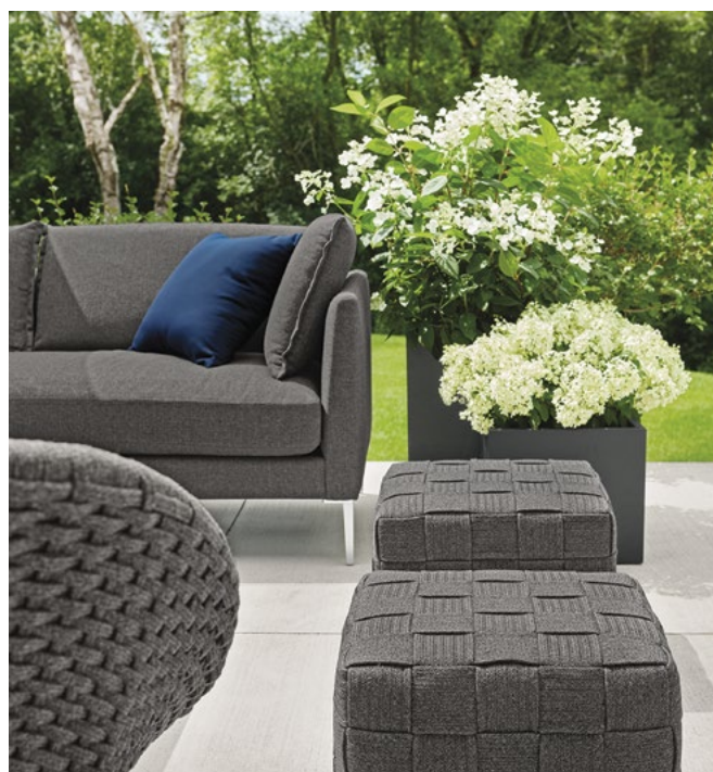
▲ The clean-lined Flet outdoor-seating collection from Room & Board includes chairs and ottomans crafted of woven polypropylene rope that's soft, durable and UV-resistant. Cushions are made of quick-drying foam and covered in Sunbrella fabric for easy maintenance. roomandboard.com