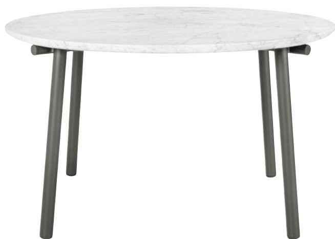
▲ Part of Patricia Urquiola's Anatra Collection for JANUS et Cie, the Anatra Dining Table Round 130 combines an aluminum frame with stainless-steel hardware and nylon glides. Available in Cadet and Oxford finishes and a Carrara marble or ceramic top. Pictured here: an Oxford base topped with marble. janusetcie.com