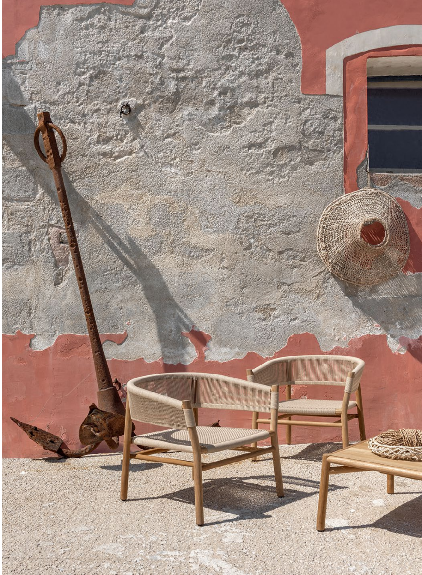
▲ Named for the eponymous Scottish garb, the Kilt chair was designed for Ethimo by Marcello Ziliani as a woven band of rope stretched over a teak frame. Available in natural or pickled teak, paired with sand-hued or gray rope; a coffee table is also on offer. ethimo.com