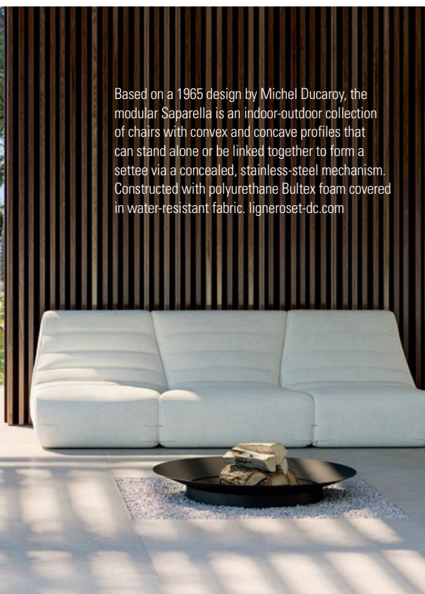
Based on a 1965 design by Michel Ducaroy, the modular Saparella is an indoor-outdoor collection of chairs with convex and concave profiles that can stand alone or be linked together to form a settee via a concealed, stainless-steel mechanism. Constructed with polyurethane Bultex foam covered in water-resistant fabric. ligneroset-dc.com