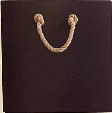
The knotted rope handles on this steel vessel prove that delight is in the details. Vineyard Planter, price upon request, formationsusa.com