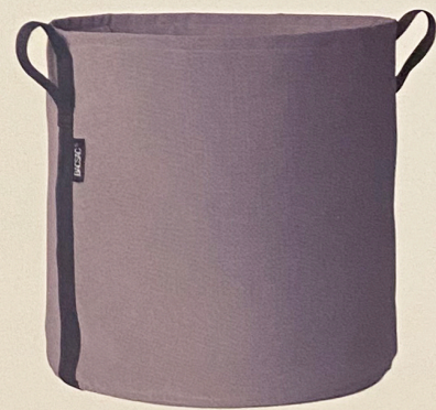
Lightweight, innovative fabric creates a topiary tote that steals its looks from your favorite bag. Batylite Plant Pot, $98, bacsac.com

3. TREE HUGGERS Consider it a migratory pattern: These containers are so good-looking, you'll want to make their move indoors permanent. Oversized, artful and bearing no resemblance to their garden variety terra-cotta cousins, they're ideally sized to hold an ornamental tree for a year-round breath of fresh air.