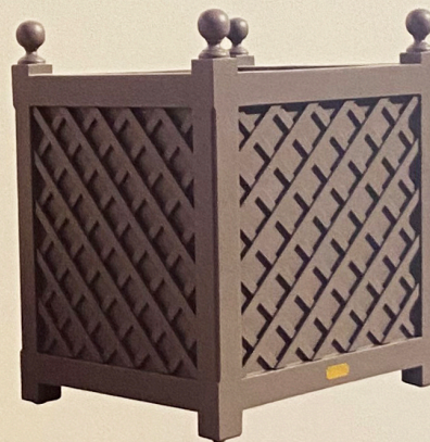
A texture that's always welcome: classic latticework, especially when combined with finials. Wood Trellage Planter, $1,950, accentsoffrance.com