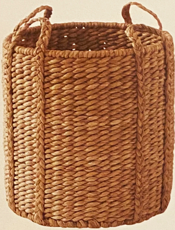
At two feet tall, this woven abaca number provides all the natural camouflage you need for tree roots (or toys). Lubid Abaca Basket, $630, fschumacher.com