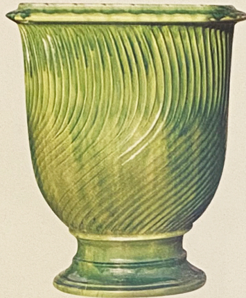
Produced in Provence, this glazed urn is a rhapsody en vert. Anduze Strie Vert Emaille Planter, $1580, authenticprovence.com