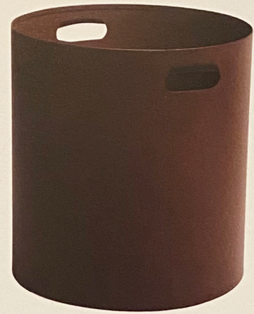
This industrial-chic looker is ingeniously perched atop four hidden casters for easy transport. Irony Outdoor Pot Planter by Maurizio Peregalli, $770, artemest.com