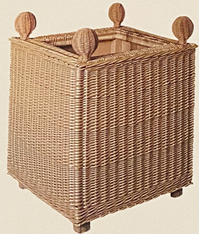
Woven by a French concern with a 150-year history, wicker puts a fresh spin on a classic Versailles planter. Vallabrégues Planter, price upon request, ateliervime.com