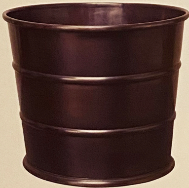
Made of copper and zinc, this artistically ringed specimen belongs on your fancy bucket list. Ribbed Planter, from $815, bronzino.co.uk