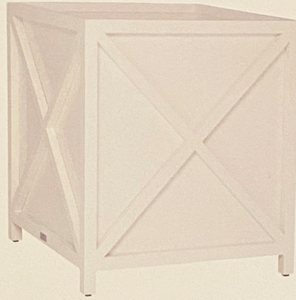
Powder-coated aluminum does wood one better in this perfectly pared-down box planter. Azimuth Cross Planter, $3,119, janusetcie.com