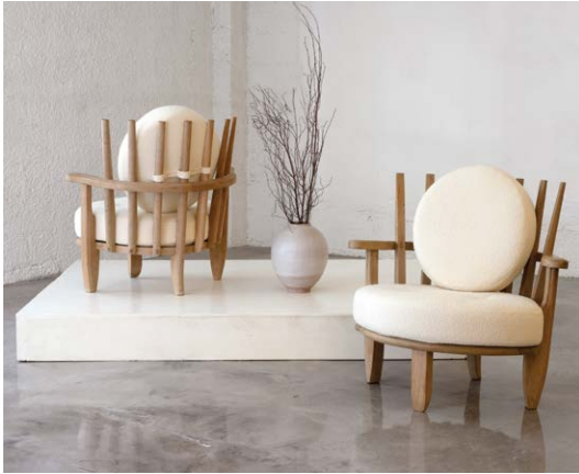
ABOVE: A pair of 1950s lounge chairs with spindled backrests by French designers Guillemette et Chambron

indoor salon and garden for the large-scale fountains, statuary, planters, flooring, and other imported goods Authentic Provence is well-known for, as well as an adjacent space called AP Mid Century Modern, where the focus is on original twentieth century European furniture, lighting, and paintings and other artworks from Italy, France, Scandinavia, and the United States. That means a visit here can yield finds like a circa-1900 hand-carved marble table from a long-gone Parisian bistro or an original Vladimir Kagan settee from the 1950s.