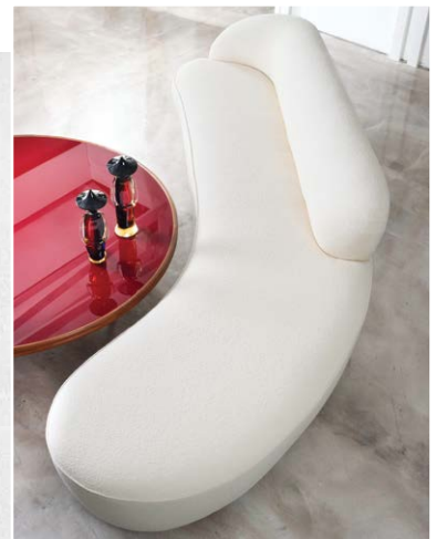
ABOVE: A midcentury-modern era curved settee designed by Vladimir Kagan