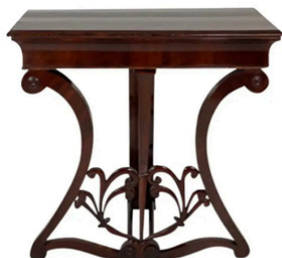
Antique Walnut Table $15,900 at 1stDibs

We're buying our way into Sheryl's beautifully-curated space with these inspired picks below.