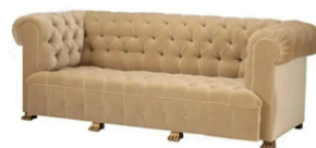
Tufted-Back Sofa $20,500 at 1stDibs