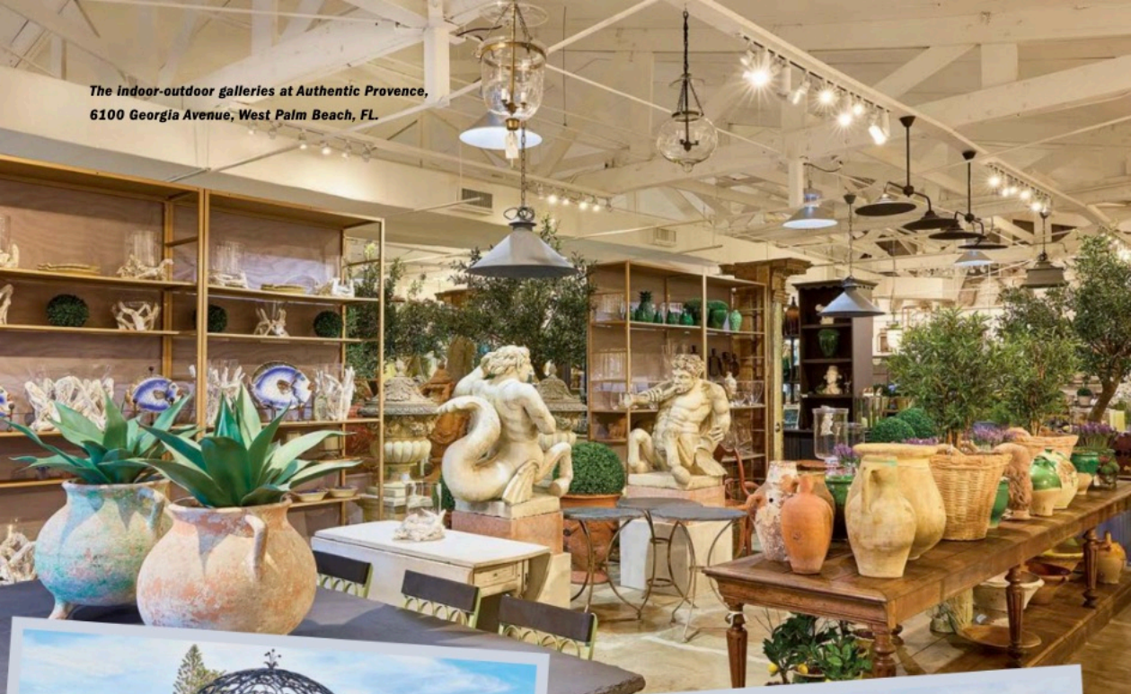
The indoor-outdoor galleries at Authentic Provence, 6100 Georgia Avenue, West Palm Beach, FL.